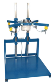
Bulk Bag Filling Station