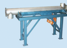
Vibratory Tube Conveyor