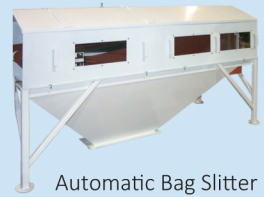
Automatic Bag Slitter