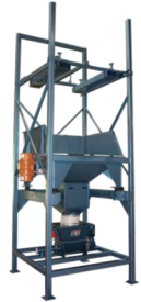
BBU fork lift