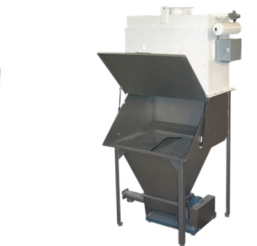
w/dust collector & feeder