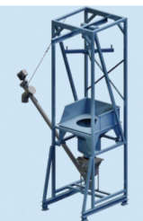
w/bulk bag unloader