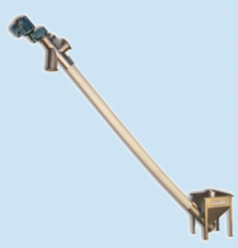
Flexible Screw Conveyor