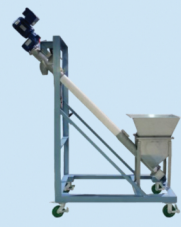
w/ portable stand