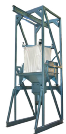
BBU I-beam (hoist)