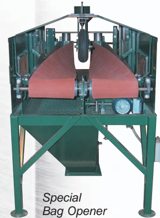
Special Bag Opener