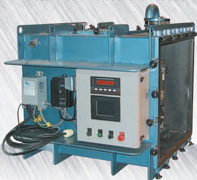
Pressurized Enclosure for Feeder